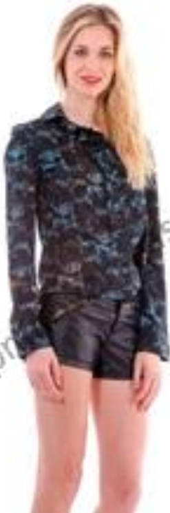
DR 2791 (2)