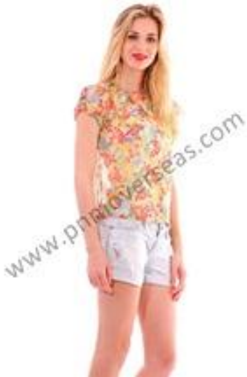
DR 2785 (2)