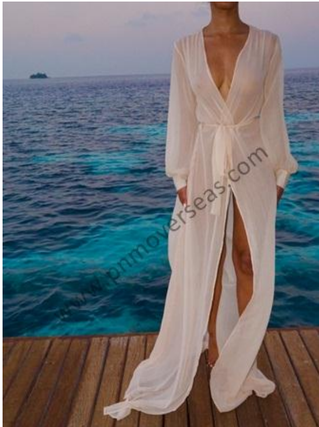
DR 3712 (2)