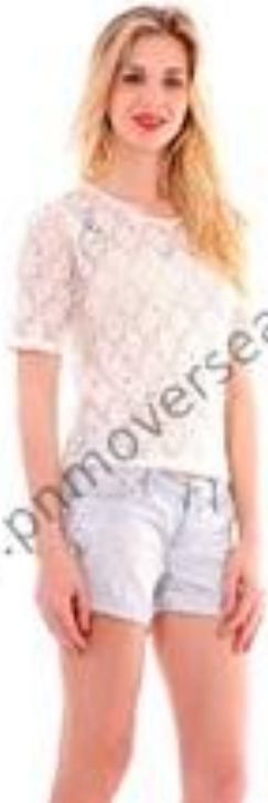
DR 2802 (2)